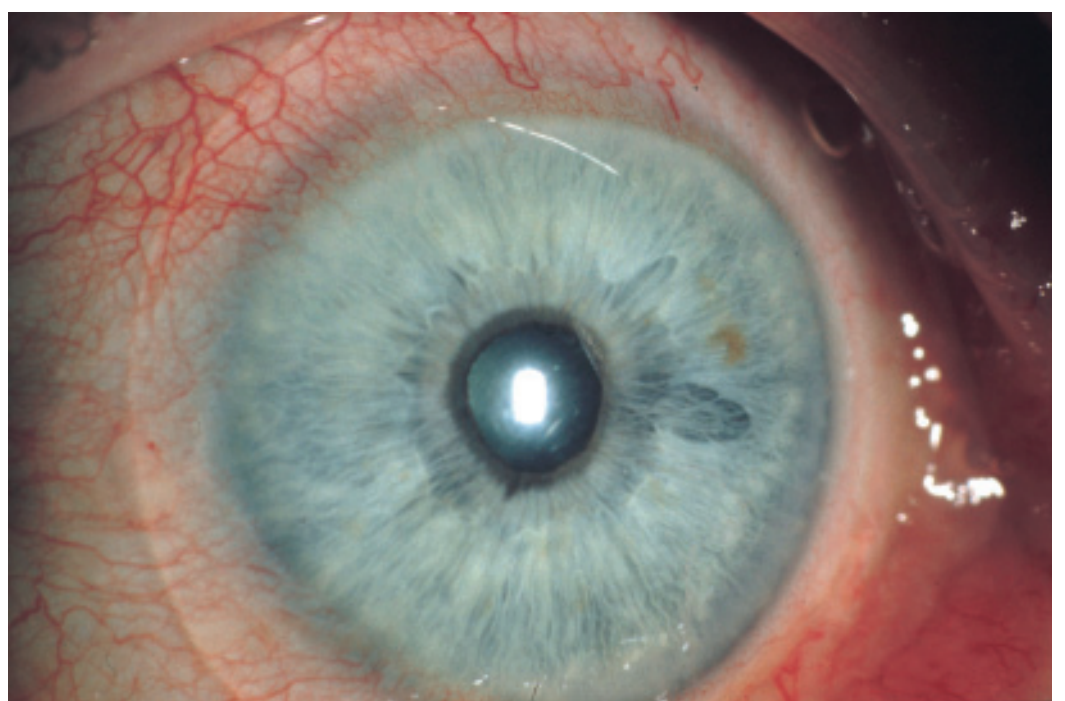
Fig 2. Soft bandage contact lenses (base-curve 8.70 and diameter of 18 mm) were fitted. The borders of these large contact lenses are clearly visible. (a) Right eye (b) Left eye