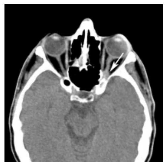
Fig 1. (left) CT demonstrating a lesion at the left orbital apex, with thickening of the optic nerve.

Radiological examination of the orbits Computed tomography (CT) of the orbital region was suspicious for an intra-orbital mass with optic nerve involvement on the LE and infiltration of the right ethmoidal sinus (fig 1). Orbital MRI confirmed the presence of a contrast enhancing lesion originating in the orbital apex, surrounding the optical nerve of the LE (fig 2) and a second enhanced irregular mass in the