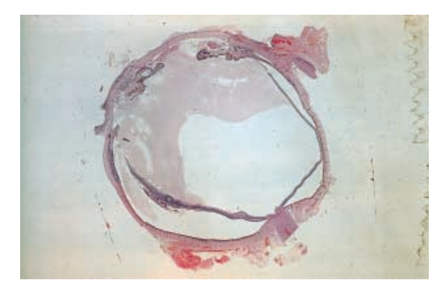
Fig. 2: Horizontal transpupillary section of the left eye. There is infiltration of epithelial tumor cells between the corneal lamellae and along the anterior chamber wall with floating cells in the anterior chamber. The tumor grows over the anterior surface of the iris and shows deep invasion of the ciliary body with muco-epidermoid differentiation. (Stain, hematoxylin-eosin).

Hg. Because of his Kahler disease the diagnosis of uveitis secondary to his plasmocytoma was considered and an anterior chamber punction was performed. Cytology showed atypical cells of epithelial origin with differentiation towards keratinisation. Iris biopsy revealed normal iris tissue covered by a multilayered squamous cell epithelium with mild atypical cells. Therefore, we investigated the past medical and ocular history. It appeared that several weeks before the onset of the uveitis an atypical pterygium was excised at the peripheral hospital at the same eye. It was a white, round, slightly elevated lesion, surrounded by dilated blood vessels and localised in the temporal upper guadrant of the left eye. The pathologist of the peripheral hospital described it as a lesion with mild atypical actinic changes. This biopsy specimen was reviewed and the histopathologic diagnosis of invasive squamous cell carcinoma was made. The eye was enucleated and histologic examination of the eyeball showed a large invasive squamous cell carcinoma of the bulbar conjunctiva, extending between the corneal lamellae and covering the corneal endothelium and the anterior and posterior iris surface. Free-floating tumour cells were present in